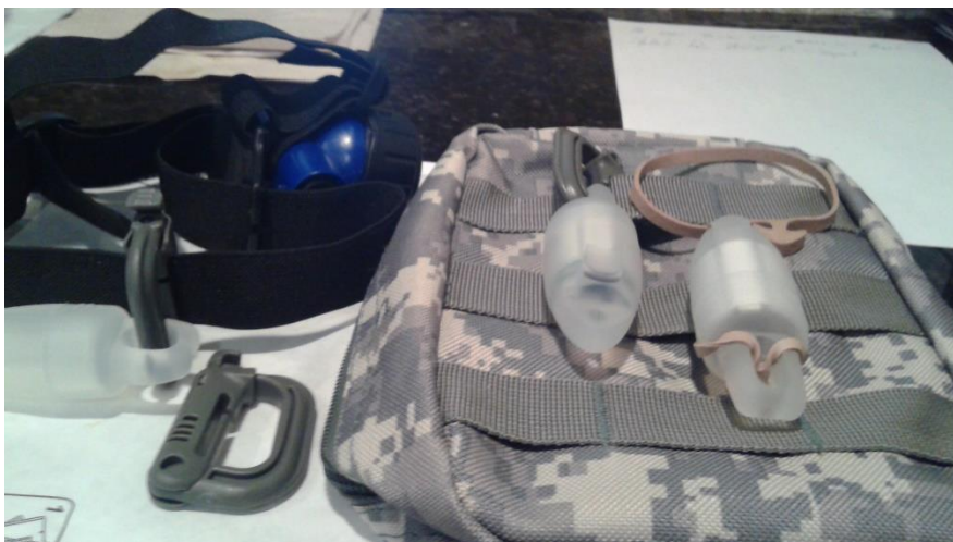
Image demonstrates how the T-tab will hold the E/T Light in place. D-clips, S-Biners, lanyards, keyrings, and other methods available for easy attachment

Once 3" EPDM plastic T-Tab is attached through the Nose Cone hole you can wrap it behind MOLLE, helmet straps, antennas, etc., and secure by looping T-tab through end cap loop (shown in picture). Alternatively, loop around end cap without securing T-Tab