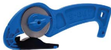
QE – blue